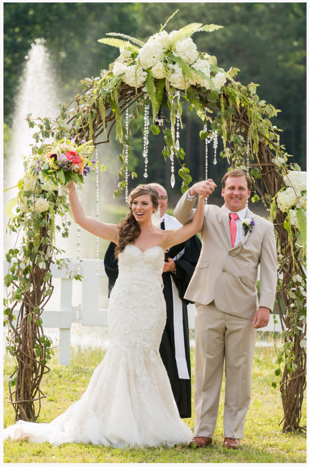
Thank you for your interest in Catering Works. We look forward to planning a delicious and memorable day for you, your family and friends.