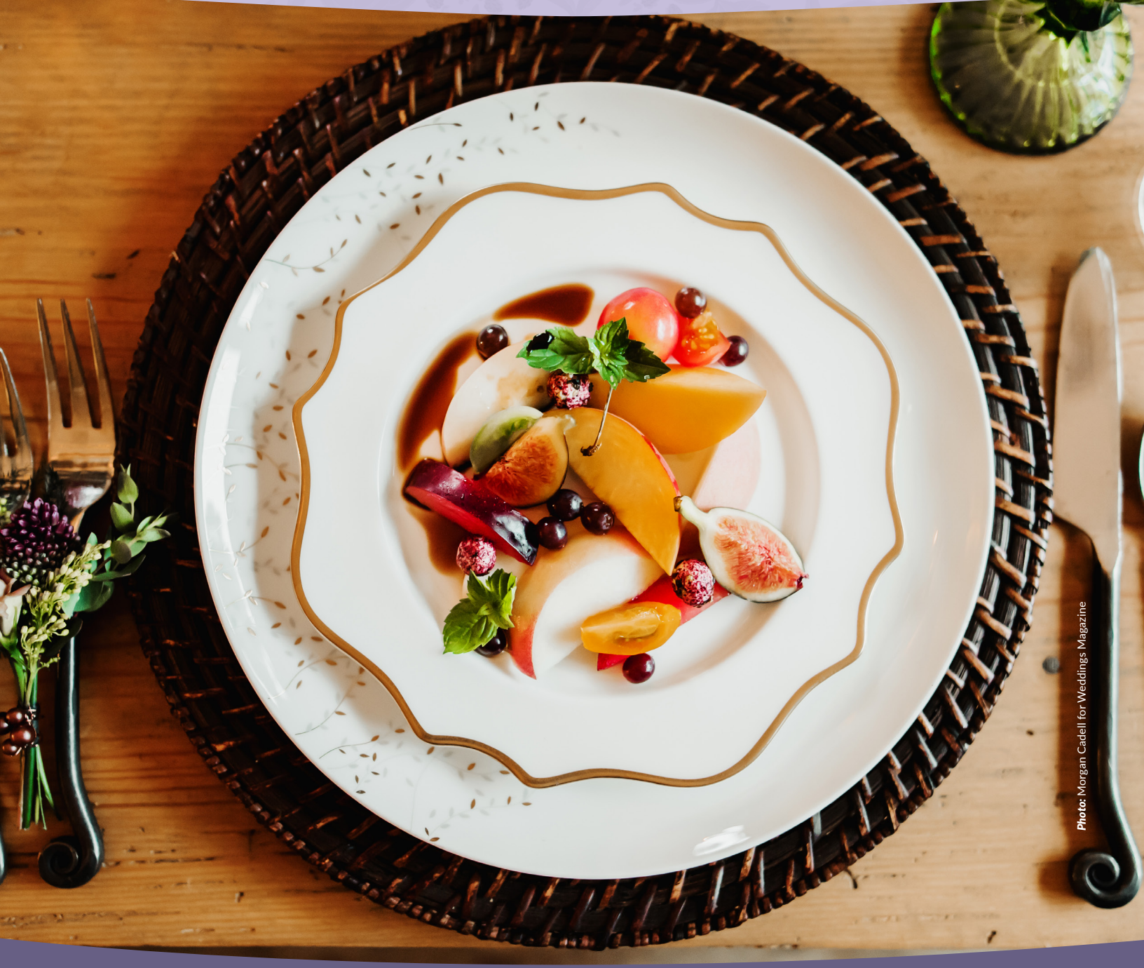
G U I D E • 2021 •